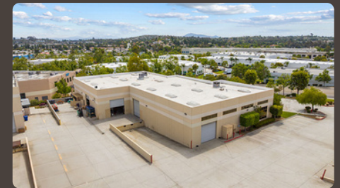
Dock & Grade Loading